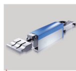
ULTRASONIC WELDING SYSTEM