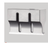
TITANIUM SONOTRODE 20 kHz

DO YOU WANT SAVE TIME DURING TEXTILE CORD SPLICING?